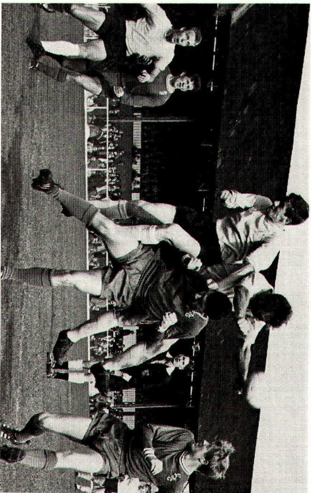
The Watford defence under pressure from a corner during the game against Gillingham.